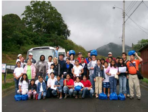
The Sharon Baptist / CLF evangelism team before heading out into a new section of Los Guido. We saw much fruit come from the efforts of all on this day. Praise be to our Lord Jesus Christ!