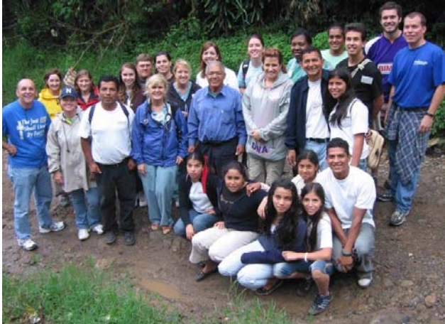
This is the evangelism team again with a man that accepted Christ. He had been in his home praying to God just that morning that the government would somehow bring him food— because he had none. Then the teens knocked on his door and offered him the food bag as well as fellowship from Christian brothers and sisters.